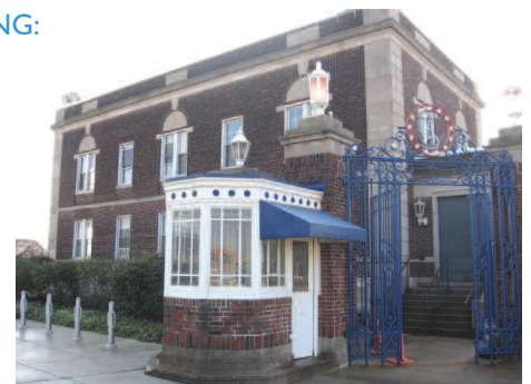
Building 500, located at the front gate, is ideal for restaurant development.